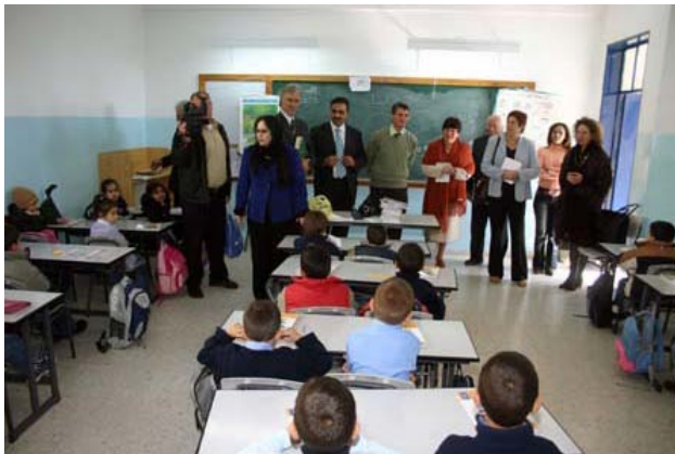
Visit to a school in Ramallah with the Board of UEF, November 2006