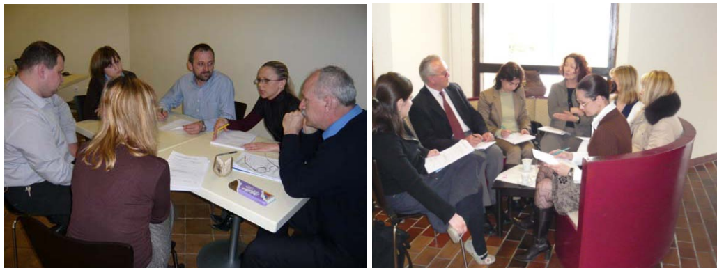
EU CARDS Adult Learning, Croatia, 2008

The EIESP has built up a solid reputation as an experienced, international and innovative partner in education policy design, management, reform and evaluation at European, national, regional and institutional levels. The institute contributes to studies for the European Commission (for example most recently on key competences in school and teacher education). It contributes to reform processes in countries in transition and emerging economies and it undertakes evaluations of innovative European projects and programmes (for example on education for inclusion and diversity). For further information: ieeps@eiesp.org .