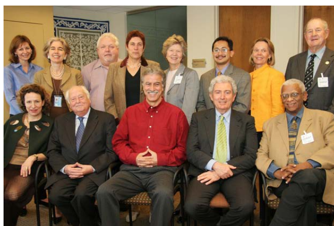
UEF Board and partners meeting in Synergos and at the United Nations, New York, March 2007