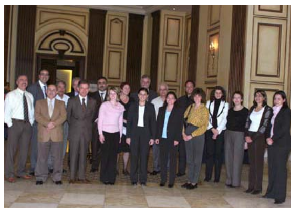
Seminar organised by UEF to launch its 'Voice of Children' programme, Amman, February 2006

Contact details: Université de Paris-Dauphine, Place du Maréchal de Lattre de Tassigny, 75775 Paris Cedex 16, France Secretariat: Telephone: 33 (0)6 38 47 68 19 E-mail: ieeps@eiesp.org - Website: www.eiesp.org