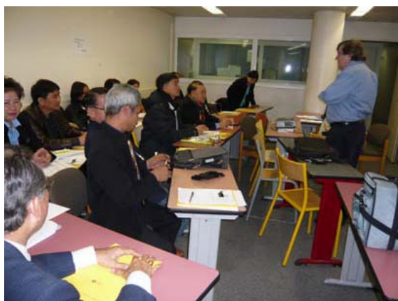
Delegation of the Ministry of Education of Thailand visiting the EIESP, February 2008

In France, the EIESP is also a partner of the French Association of Education (AFAE) has for many years participated on the editorial board of their journal Administration et Education .