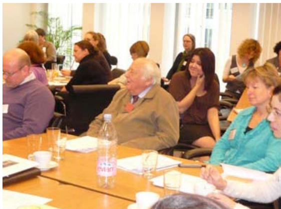
Seminar at the Welsh Higher Education Bruxelles with UWIC & UEF, February 2009

In addition to its portfolio of activities, the EIESP undertakes the secretariat and the administration of two partner organisations: