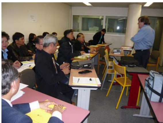
Delegation of the Ministry of Education of Thailand visiting the EIESP, February 2008

In France, the EIESP is also a partner of the French Association of Education (AFAE) has for many years participated on the editorial board of their journal Administration et Education .