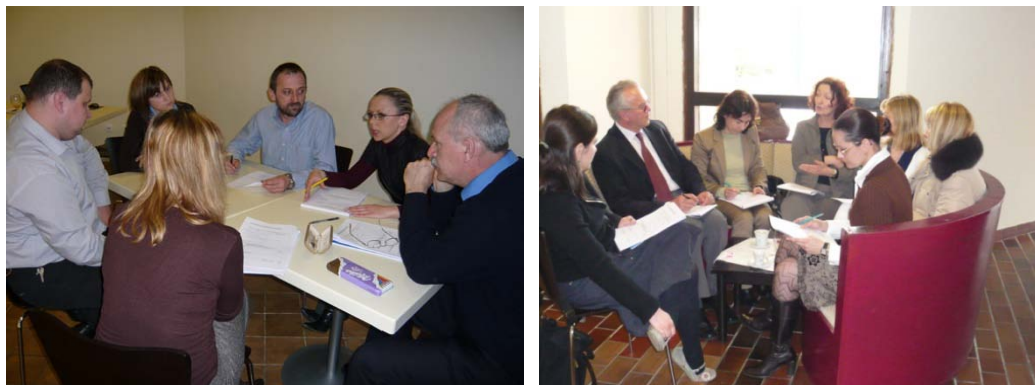
EU CARDS Adult Learning, Croatia, 2008

The EIESP has built up a solid reputation as an experienced, international and innovative partner in education policy design, management, reform and evaluation at European, national, regional and institutional levels. The institute contributes to studies for the European Commission (for example most recently on key competences in school and teacher education). It contributes to reform processes in countries in transition and emerging economies and it undertakes evaluations of innovative European projects and programmes (for example on education for inclusion and diversity). For further information: leeps@dauphine.fr .