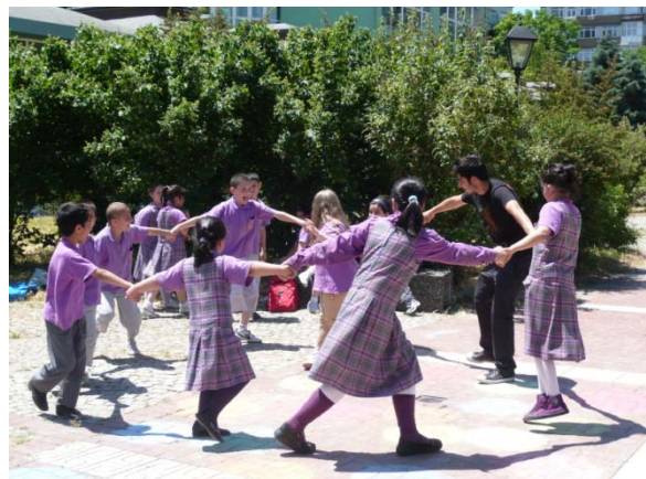
Istanbul – non-formal education in the garden of the Turkish Education Volunteers Foundation (European Foundations Centre conference, May 2008)