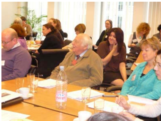
Seminar at the Welsh Higher Education Bruxelles With UWIC & UEF, February 2009

In addition to its portfolio of activities, the EIESP undertakes the secretariat and the administration of two partner organisations: