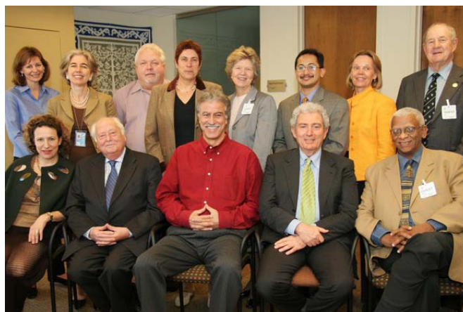
UEF Board and partners meeting in Synergos and at the United Nations, New York, March 2007