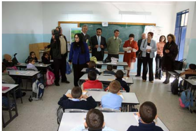
Visit to a school in Ramallah with the Board of UEF, November 2006