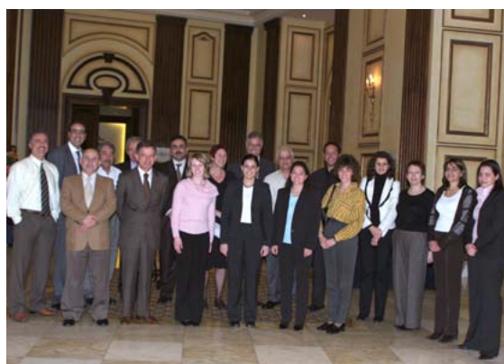
Seminar organised by UEF to launch its 'Voice of Children' programme, Amman, February 2006

Contact details: Université de Paris-Dauphine, Place du Maréchal de Lattre de Tassigny, 75775 Paris Cedex 16, France Telephone: 33 (0)1 44 05 40 01 – Fax: 33 (0)1 44 05 40 02 E-mail: ieeps@dauphine.fr - Website: www.eiesp.org